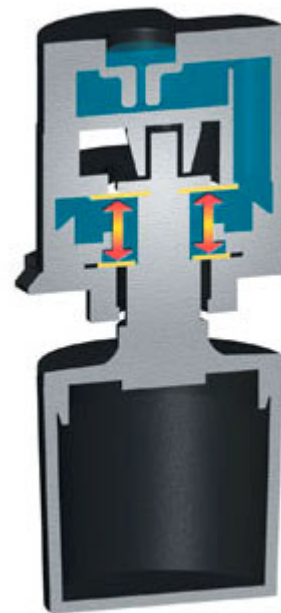
Closed Position- Displacer