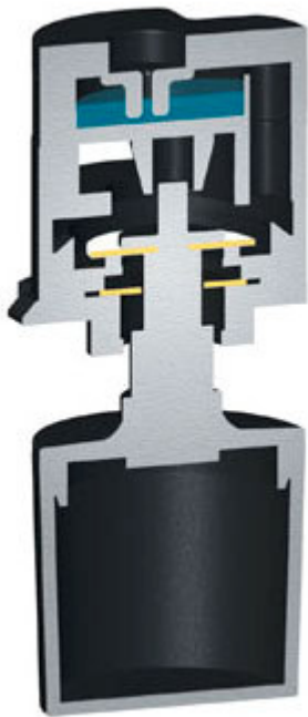
Ready Position- Displacer

Millennium SPW™ valve operation features a breakthrough patented technology that sets a new standard for reliability and versatility with single point watering. Without levers, hinges, or pivot action, Millennium SPW™ valves can operate independently of refill water supply pressure to accurately control cell electrolyte levels. Through Fluidic Displacer Valve Technology, it uses a dual, balanced valve design that allows the displacement force to act directly through the center of the valve without any mechanical leverage. The Millennium valve is very sensitive to the displacement force, allowing a very small displacer to be used. At the same time it is very insensitive to variations in the water supply pressure used, making it a true multi-pressure valve. Fluidic Displacer Technology allows the Millennium SPW™ valve to maintain the low profile and easy tube routing features. Go to- http://www.flow-rite.com/spw/millennium/mil_howitworks.html to see how it works.