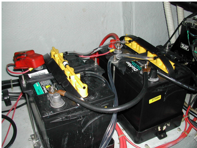
Two Battery Bank in series